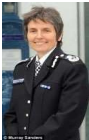
Assistant Commissioner Cressida Dick.

International Association of Women Police 53rd Annual Training Conference